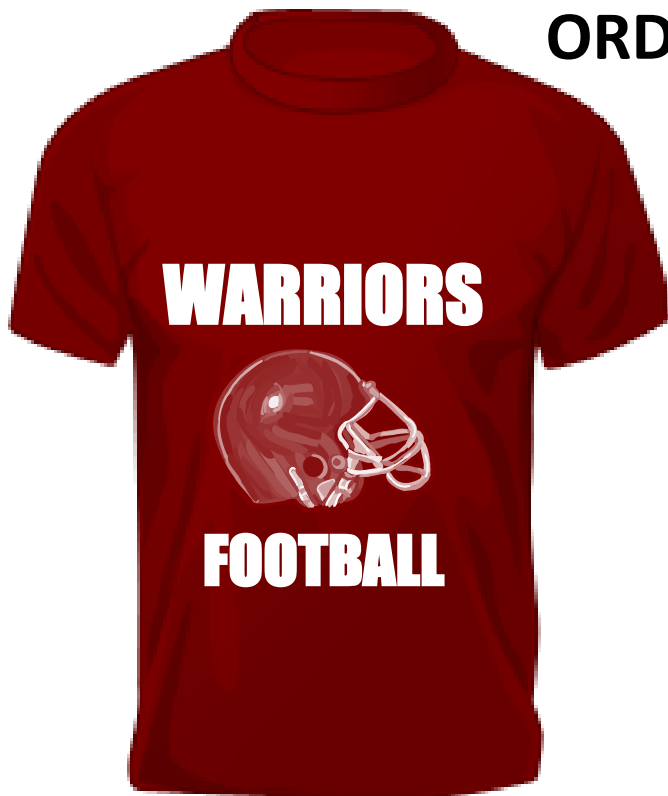
Helmet T-Shirt Maroon $5