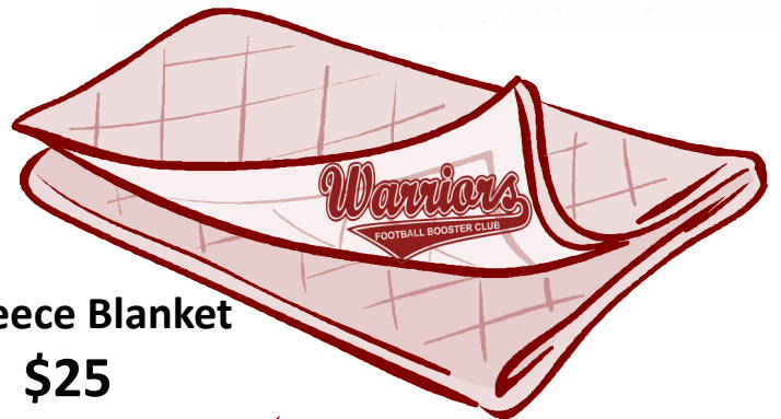
Fleece Blanket $25