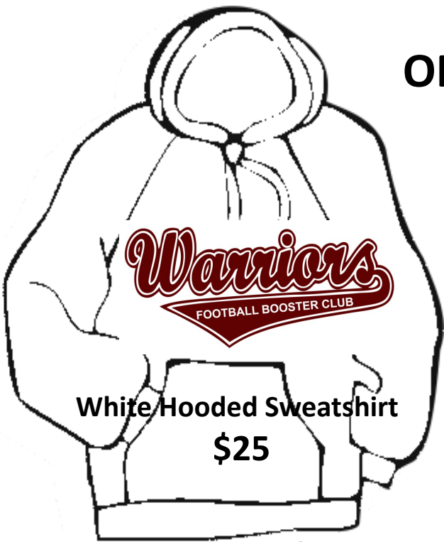
White Hooded Sweatshirt $25