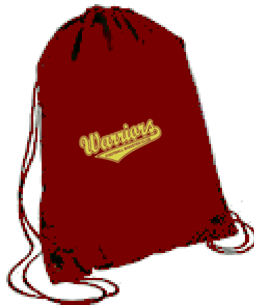
BackPack/Cleat Bag $10