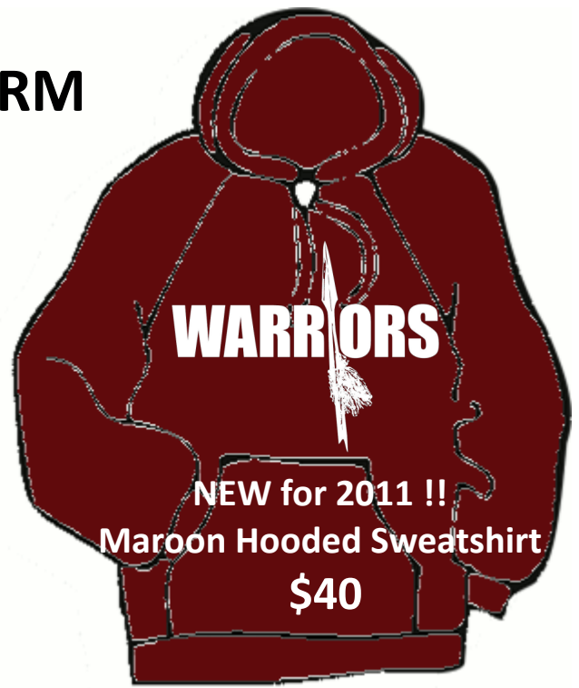
NEW for 2011 !! Maroon Hooded Sweatshirt $40