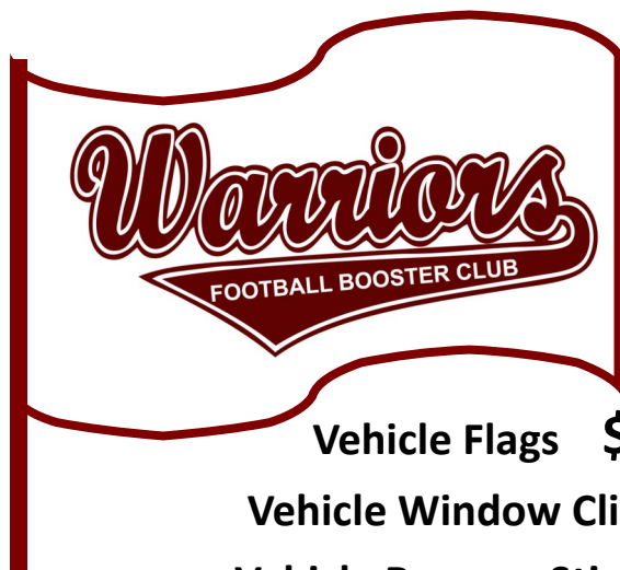
Vehicle Flags $20