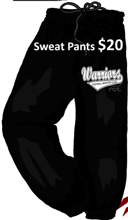
Sweat Pants $20