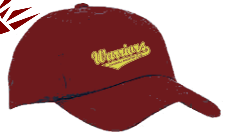
Baseball Cap $15