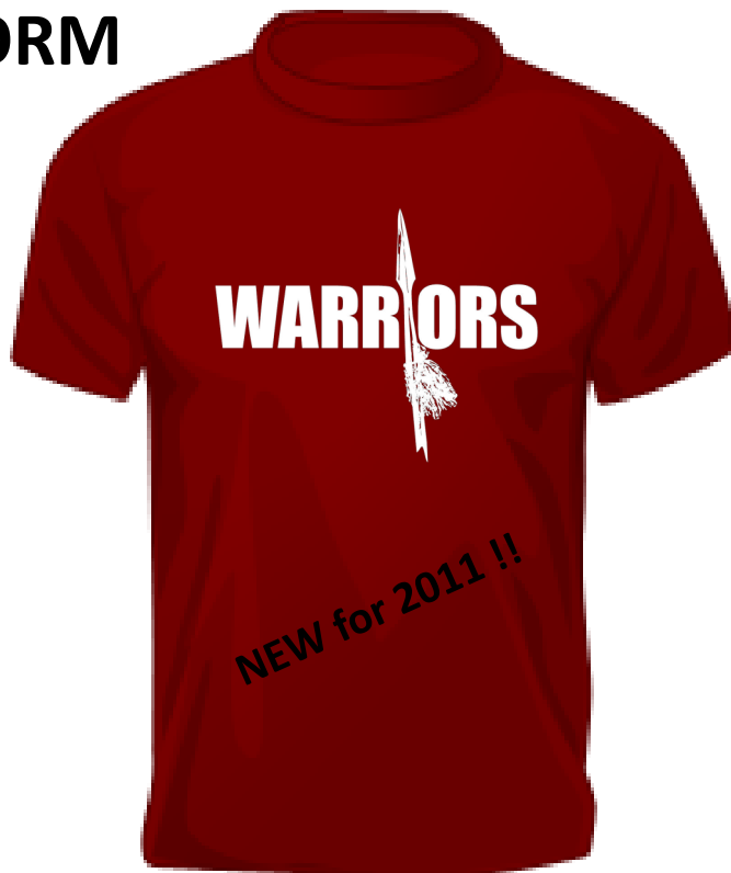
Warrior Spear T-Shirt Maroon $10